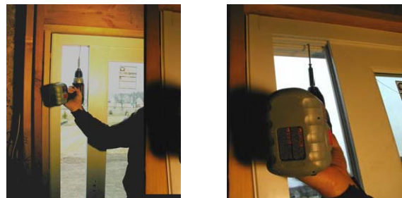
Screws placed just above the door in the header, eliminating upward motion.