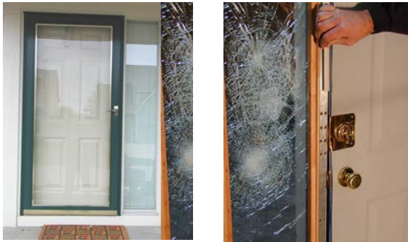
The Snap on cover conceals the "retro-fit" security product from view (right).

Side lights in entryways are common in residential subdivisions (pictured below, left) on one or both sides of the exterior door. While these types of doors are common, without proper security, they offer very little protection. The Crime Prevention Unit, working in cooperation with area home builders, tested a product which reinforces doorframes for side-light units. A "jamb brace" (pictured, below) can be installed in an existing door frame, or ordered with new doors from millwork companies.